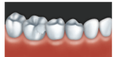
A crown can be used to restore a damaged tooth.

These are the steps dentists most often follow in making a crown, but your tooth may need special care. You may need orthodontic treatment, gum treatment or root canal treatment. It may take more than 2 visits to your dentist, or your visits may last longer.