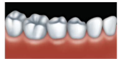
The final crown is cemented into place. It looks and works very much like a natural tooth.